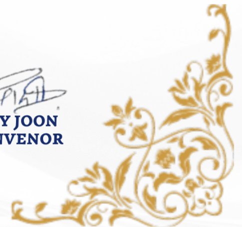
GIXY JOON CONVENOR