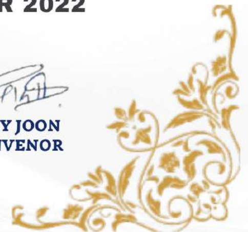
GIXY JOON CONVENOR