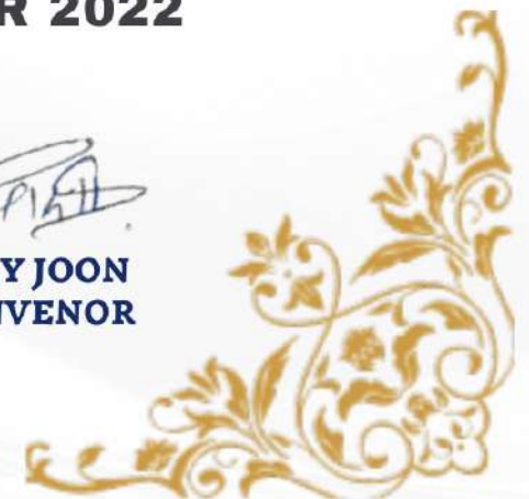
GIXY JOON CONVENOR